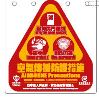
Aerosol Generating Procedures